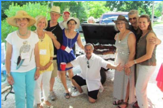
Members of the Lafayette Society and the American Friends of Lafayette relax at the pig pickin' in June after the AFL meeting.