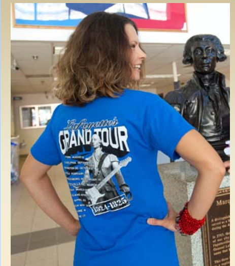
Get your Lafayette "rock concert" t-shirt today at City Center Gallery & Books in Downtown Fayetteville!

There's plenty more to come in 2015 – stay tuned, and please join us!