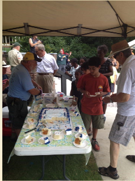
Boy Scouts helped serve cake and ice cream at the Lafayette Birthday party in the park.