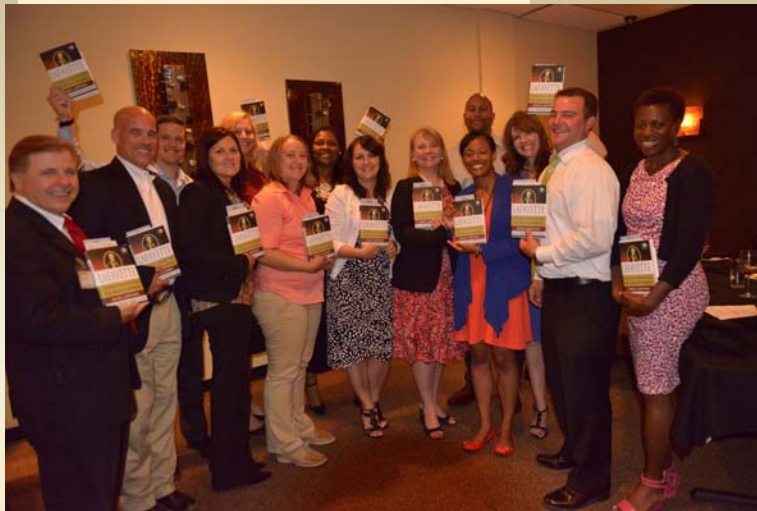
Participants in the Chamber of Commerce's Leadership Fayetteville program were presented with a copy of Lafayette: Lessons in Leadership from the Idealist General .