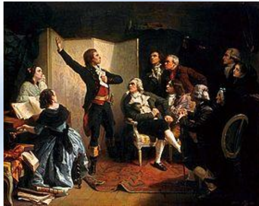
Rouget de Lisle singing la Marseillaise for the first time in the City Hall of Strasbourg (Pils, 1849).